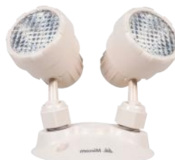
EL-7030B (24 pcs)