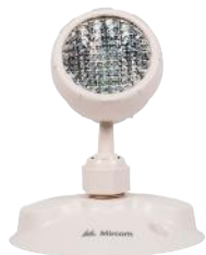
EL-7030A (48 pcs)