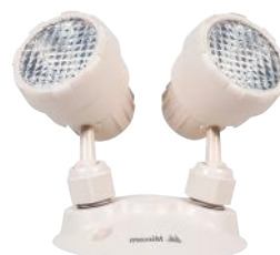
EL-7030B (8 pcs)