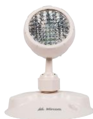
EL-7030A (16 pcs)